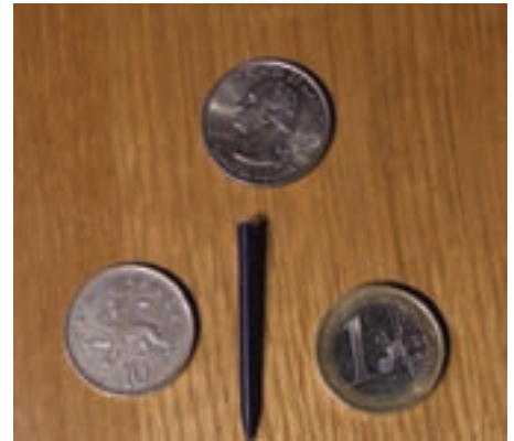
The supplied stylus is far too small to be useful

"As GPS/GNSS users of 15 years, we have welcomed the impact of Magellan solutions on the market, and have moved to use of their systems over recent years. We have applied the MobileMapper CE and now the CX to surveys of cycle tracks citywide, neighbourhood accessibility and network analyses, and parking space, tree, field and marine ecology surveys. Our tests of MobileMapper 6 have been very positive too, especially with the easy-to-use post processing option - delivering well structured data at accuracies around the metre mark. While the MM6 is not at the consumer price level, it is ideal for field surveyors looking for lower cost tools to do the same job that might have cost 10K to 20K euro ten years ago." Gearoid O'Riain, Managing Director, Compass Informatics Ltd, Black Rock, Co. Dublin, Ireland