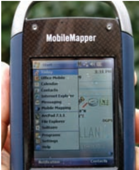
The Today menu that greets you on start-up, which is configurable by the user.

match that of the MobileMapper Pro line in delivering meter-level accuracy at an affordable price.