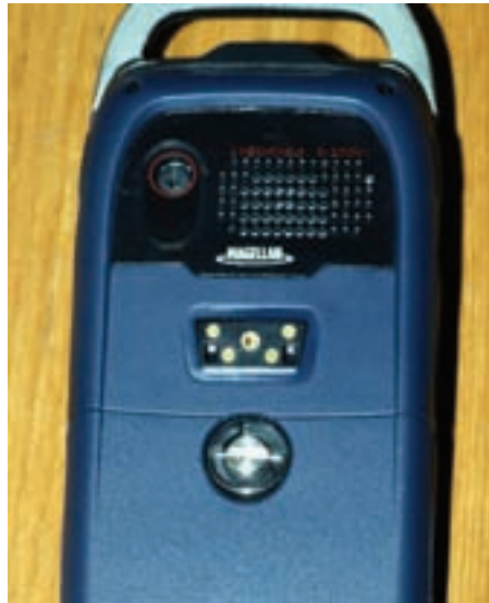
Backside view of MobileMapper 6, showing the speaker grill, 2 megapixel camera lens, unique USB connection and battery compartment.

MobileMapper 6 has Magellan's own Mobile Mapping application, and can also run any other Windows Mobile compatible software. Being familiar with ESRI's ArcPad from prior PDA reviews, I chose to use that application (which comes bundled with the unit, in the USA). Everything worked just as expected, including easy synchronizing with the desktop when necessary. There is simply not sufficient room in this review to go into more detail on the software, but let the professionals using MobileMapper 6 tell their own story.