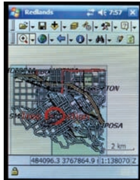
Look at the clarity and detail possible on this small screen – easily usable in any field or office lighting conditions

MobileMapper 6 is ideal for small(er) projects where 2 to 5 metre GPS accuracy is acceptable – or 1 to 2 metre with post-processing. Priced at considerably less than the more powerful