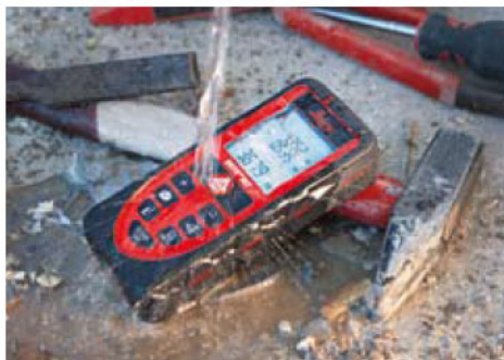
Extremely robust with IP 65 protection.