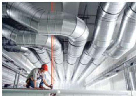
The room height is obtained effortlessly at the press of a key.